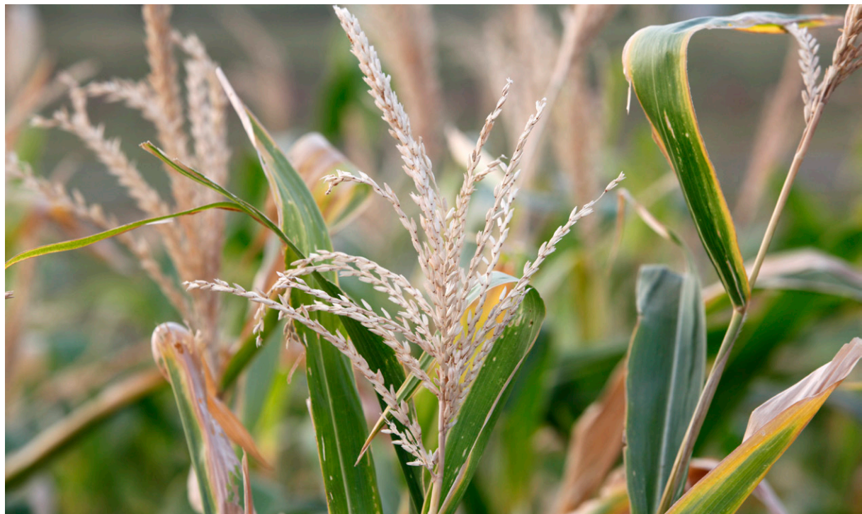
(CAMBODIA)